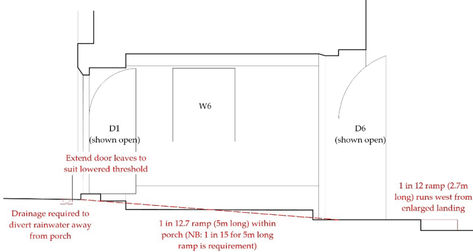
Northern Approach (used for funerals)